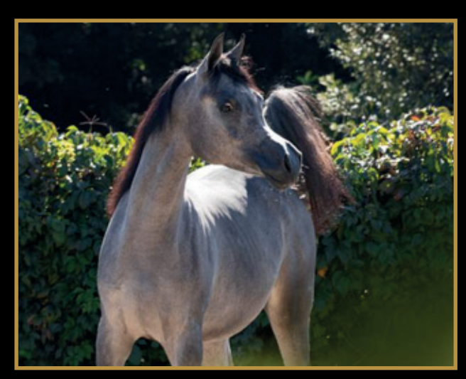
PALERMO AT Naseem Al Rashediah