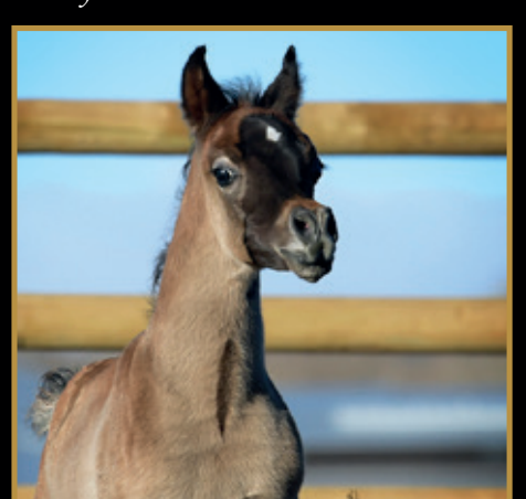
Naseem Al Rashediah | Naillla De Bloostone 2021 grey purebred Arabian colt bred by Orrion Farm