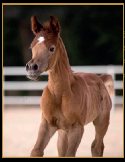
Naseem Al Rashediah | Al Jazi Al Nasser filly bred and owned by Al Nasser Stud