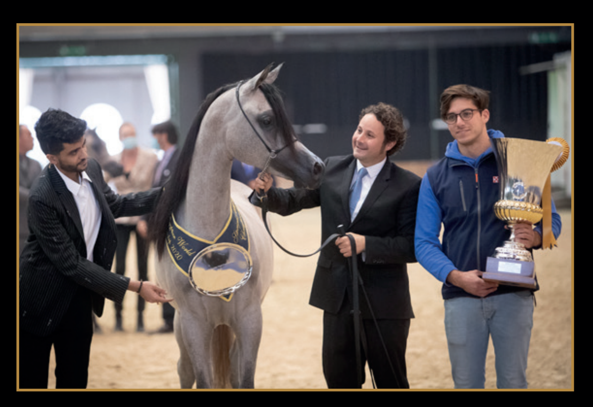
AYAH AL FALA Naseem Al Rashediah | Zumorroda Al Waab. Bred & owned by Al Fala Stud Gold Medal Champion Yearling Fillies, SEWC 2020