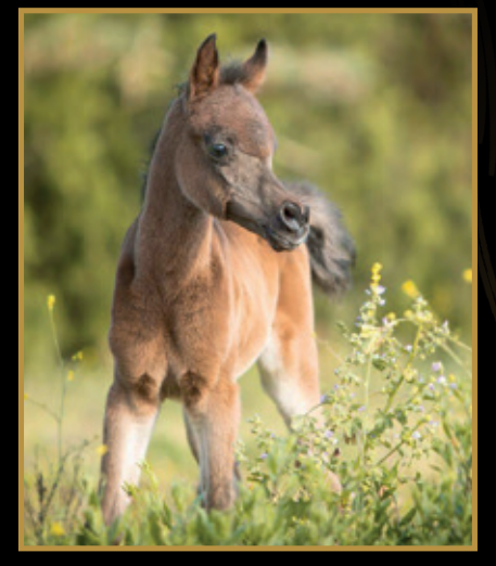
RAZAN AL JOOD Naseem Al Rashediah | FH Sharuby Rose 2021 bay Straight Egyptian filly