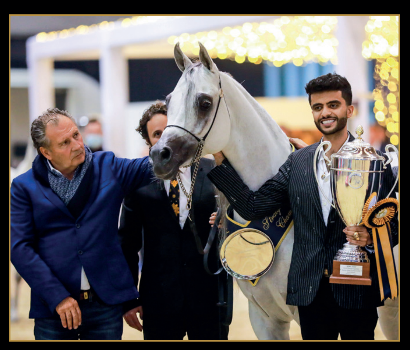
Unanimous Golden SEWC Stallion: 2020 Champion Stallion

Just one look at Naseem's impressive pedigree is enough to understand where his classic Arabian type and distinct desert beauty come from. Without a doubt, his greatness stems from the concentration of legendary individuals in his bloodlines as well as the genetic diversity of his sire and dam. Being a direct descendant of the legendary